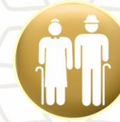
Sr. Citizens Space