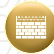
Security Boundary Wall